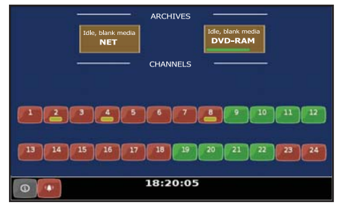
Info mode: Channels, Archives, Alerts, Live Monitor

The front panel touch screen option lets you conveniently search and replay calls, protect calls, create incidents, export, burn to CD/DVD, live monitor, view alerts, view archive status and configure the system.